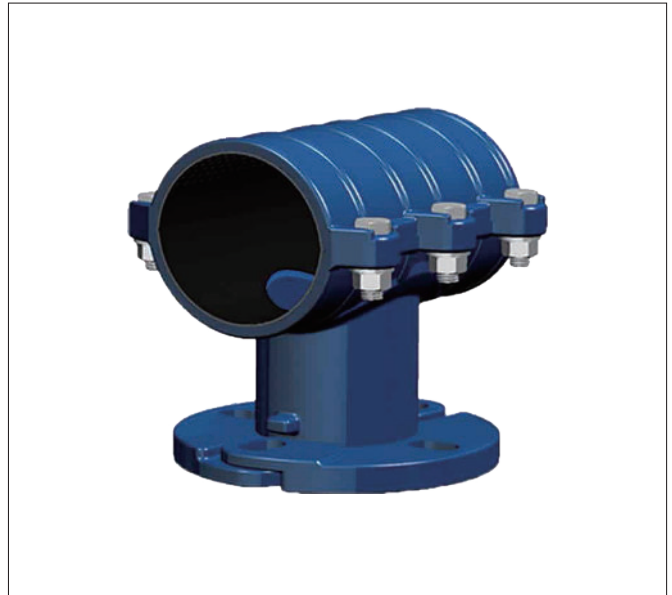
WITH FIX FLANGE

THE KEY DIMENSIONS OF SADDLE CLAMP FOR PVC PIPE WITH FLANGE OUTLET CONSIST OF TWO PARTS: