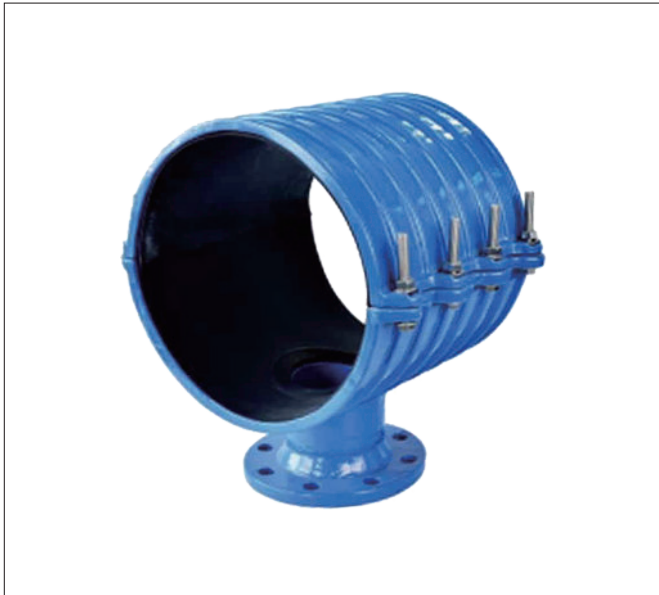
WITH FIX FLANGE

WE HAVE 2 TYPES ,ONE IS WITH FIX FLANGE AND ANOTHER IS WITH LOOSE FLANGE